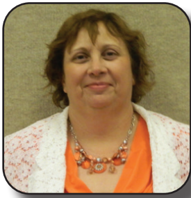
Catherine Funderburgh District Representative Ohio 1 and Ohio 2 Districts