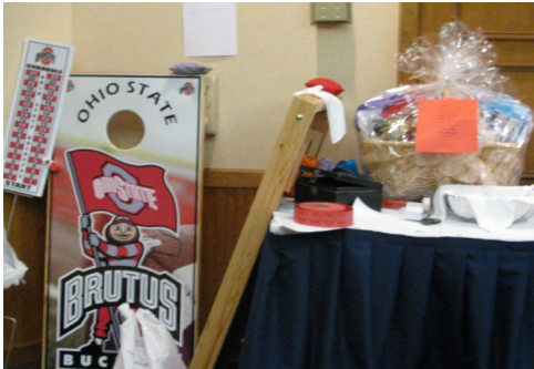
Please remember to bring your contributions to state convention for the PAC room.

THANK YOU to all contributors! Lets keep up the good work!